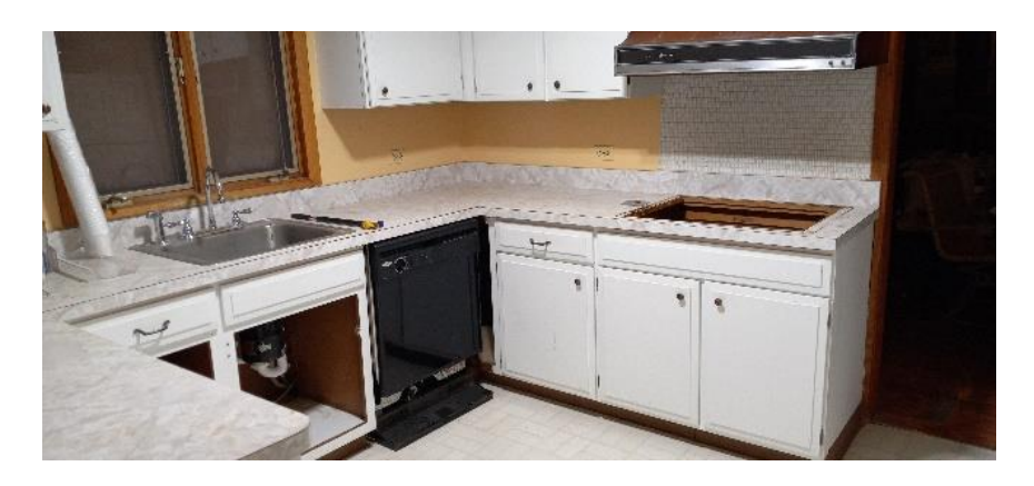
Replace electric stove with gas stove