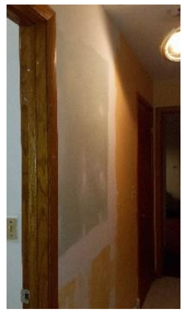
Finish Sanding and painting laundry room, bathroom and hallway on main floor