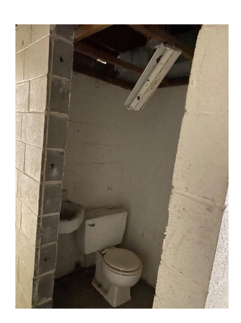
Remove toilet and sink. Cap of drain and pipes. Repair ceiling and light.