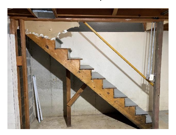
Finish Dry wall next to basement stairs and basement rooms