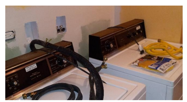
Install gas washer/dryer