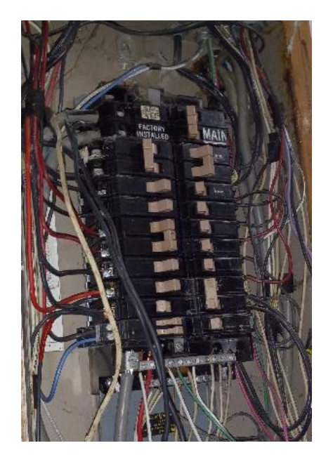
Replace Electric box and replace outlets in basement