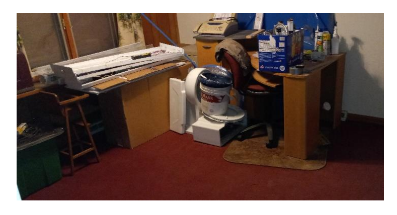
Install flooring in office