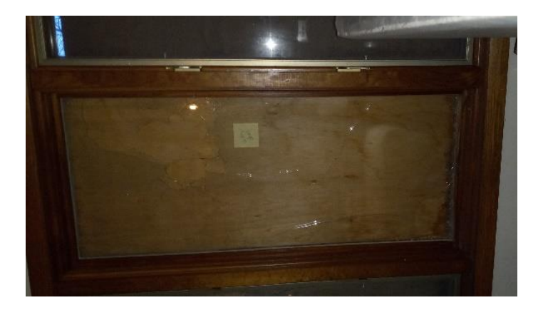
Replace broken windows and repair latches