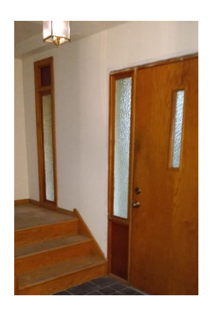
Replace front door and lights