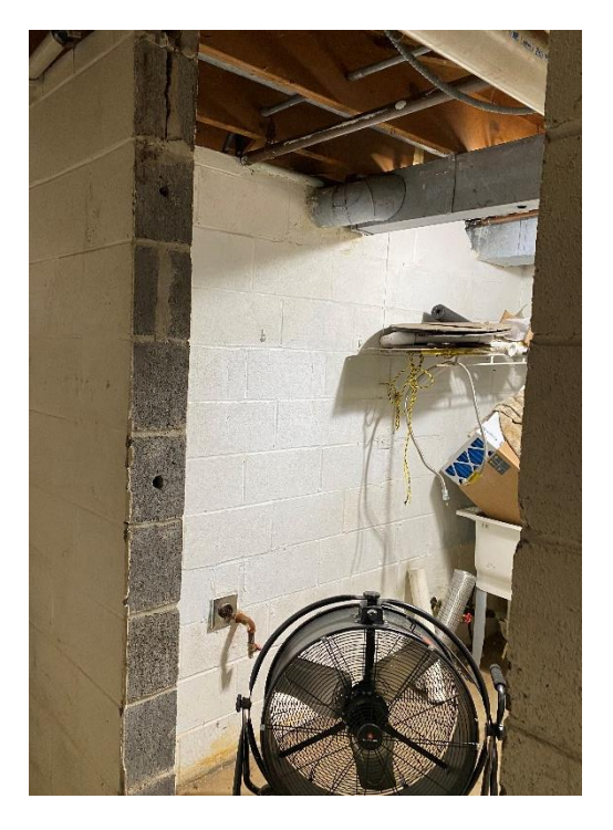
Clean out laundry room in basement and repair ceiling