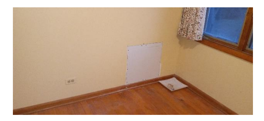
Paint walls upstairs