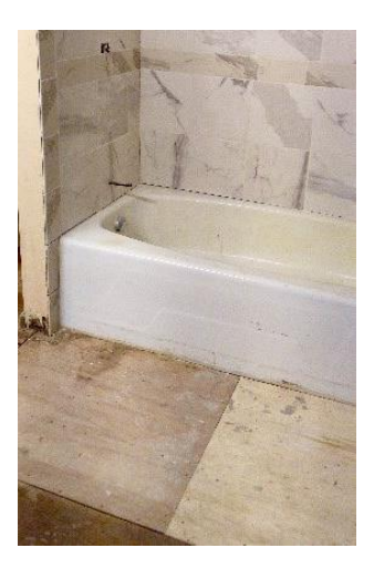
Install flooring in upstairs bathroom